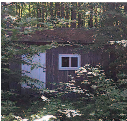
TBD CEMETERY ROAD • MANCELONA

Heavily wooded 10 acres with a cabin no utilities. State land is located directly across the street. This would make a great building location or a great getaway for hunters. Call today, so you have that great spot for hunting this fall. MLS #452500. $24,000