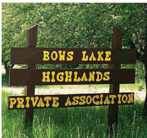
TBD BOWS LAKE ROAD • ELMIRA