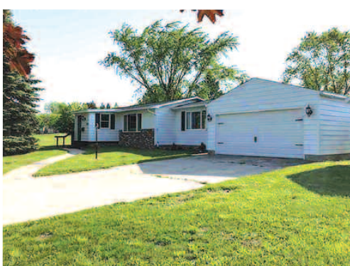
230 ANN STREET • PETOSKEY

If you are ready to be apart of East Jordan's growth and have always wanted to be your own boss, here is your opportunity. This well established business is located in the business district of East Jordan and across the street from the Marina with a beautiful view of Lake Charlevoix. With the addition of the banquet center and the patio as well as the bar you have many dining options with diversity in atmospheres. Come in for a quick lunch, relax with an old friend on the patio or a group on the deck after a day on the boat. Having a special event and need a private setting and a catered meal... the banquet room is your place... There are also 3 apartments upstairs too, one of them has a beautiful view of Lake Charlevoix. MLS #455967. $299,900