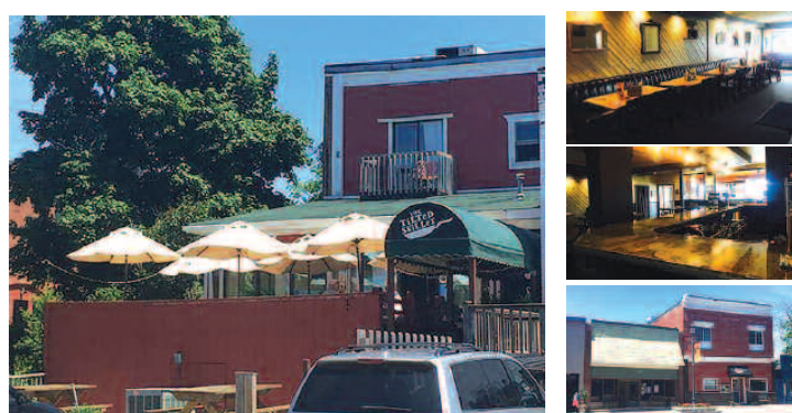
113 & 115 MAIN STREET • EAST JORDAN

As some of the most forward-thinking professionals in real estate, our agents throughout the United States and Canada have the tools and platforms to maximize your home's exposure - and they can do it quickly. Our cutting-edge technology and expansive real estate network allows a fast turn-around time on your home no matter where you're located, or where you're planning to move.